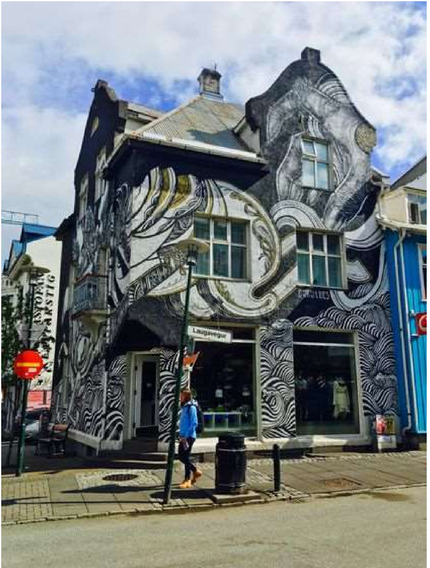
Laugavegur Street in Reykjavik.