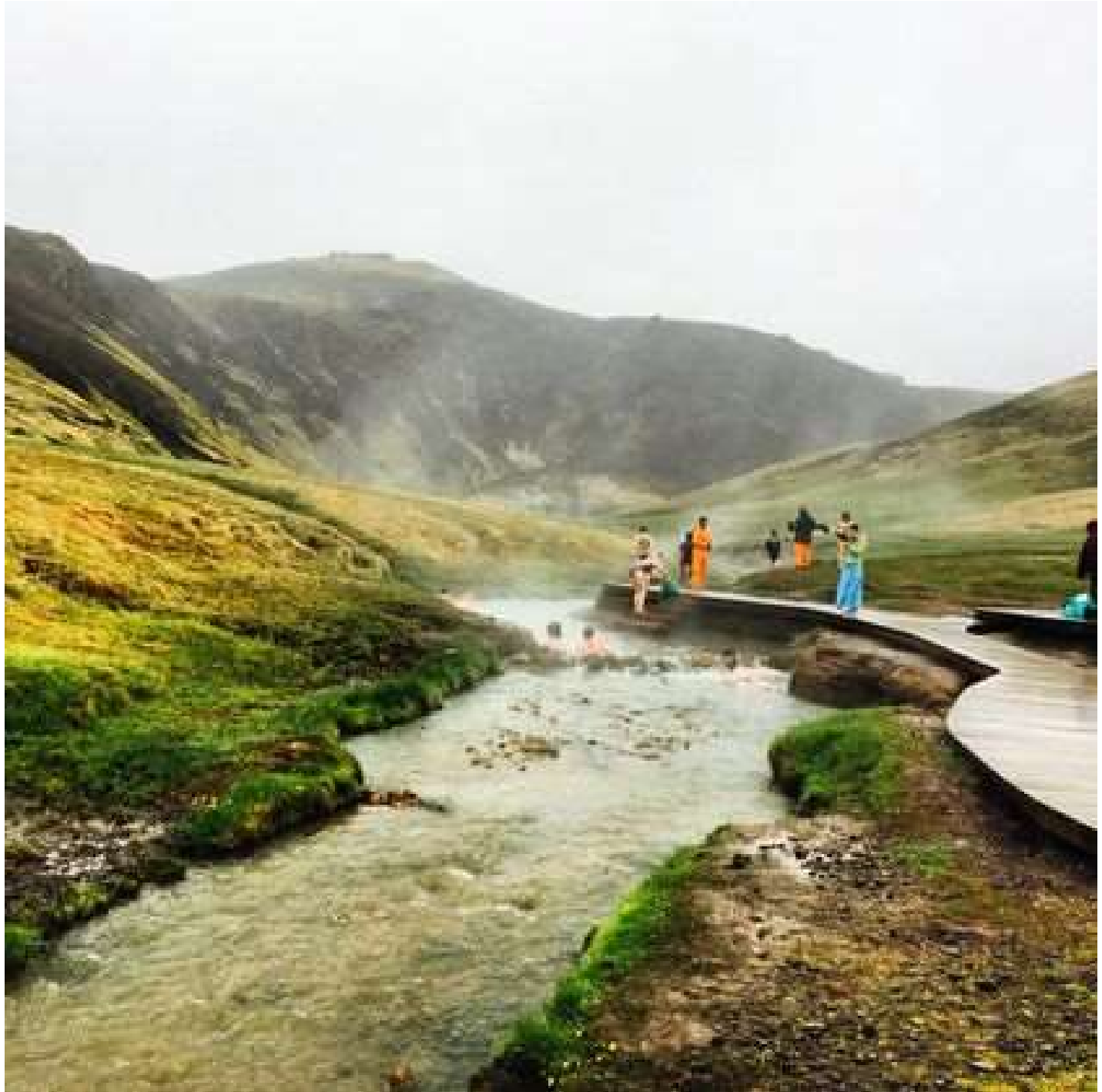
Reykjadalur hot spring in Hveragerdi.